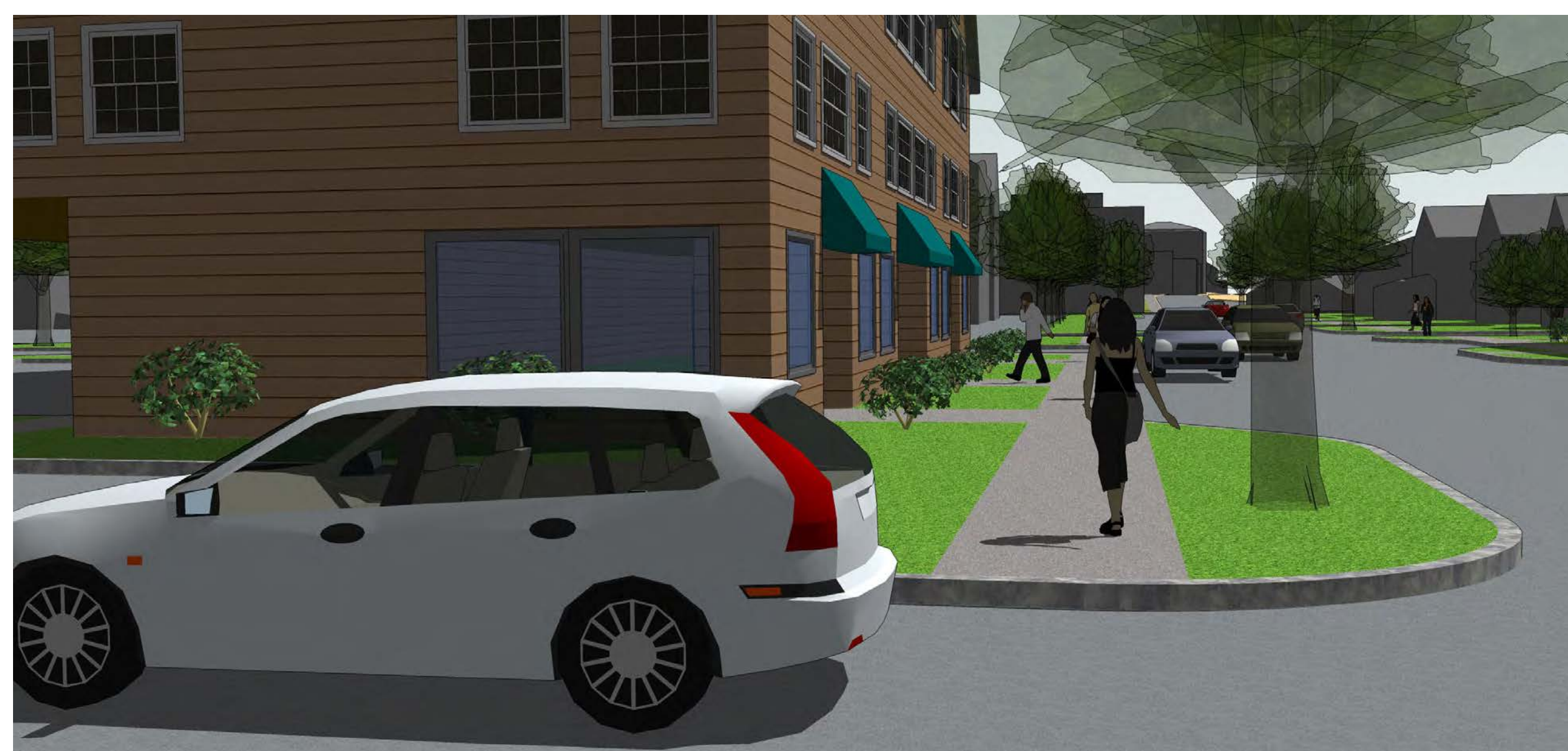
Street View Building B