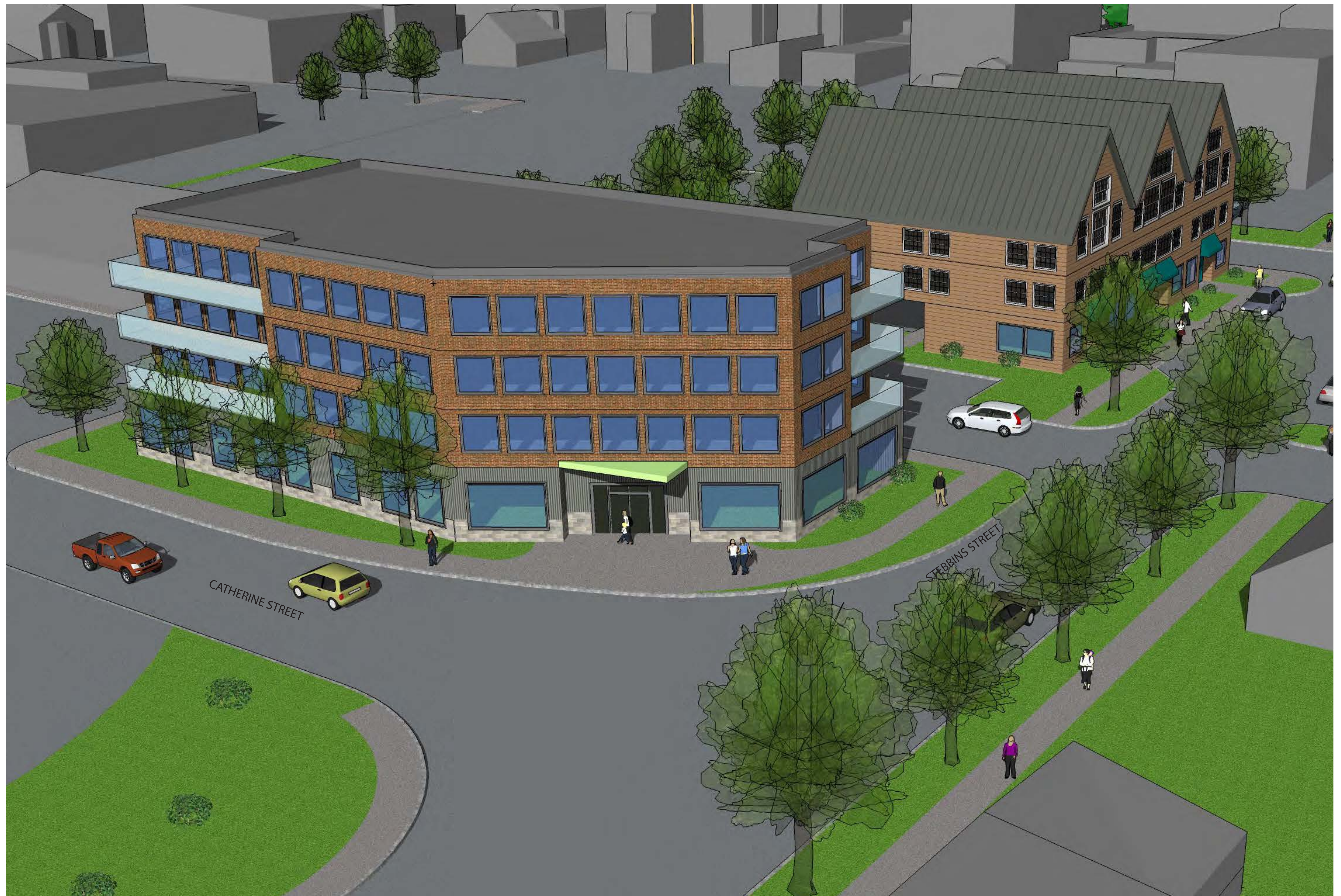
Birds-Eye Building A

* 18 On-site parking spaces available (1 per 1,150sf)