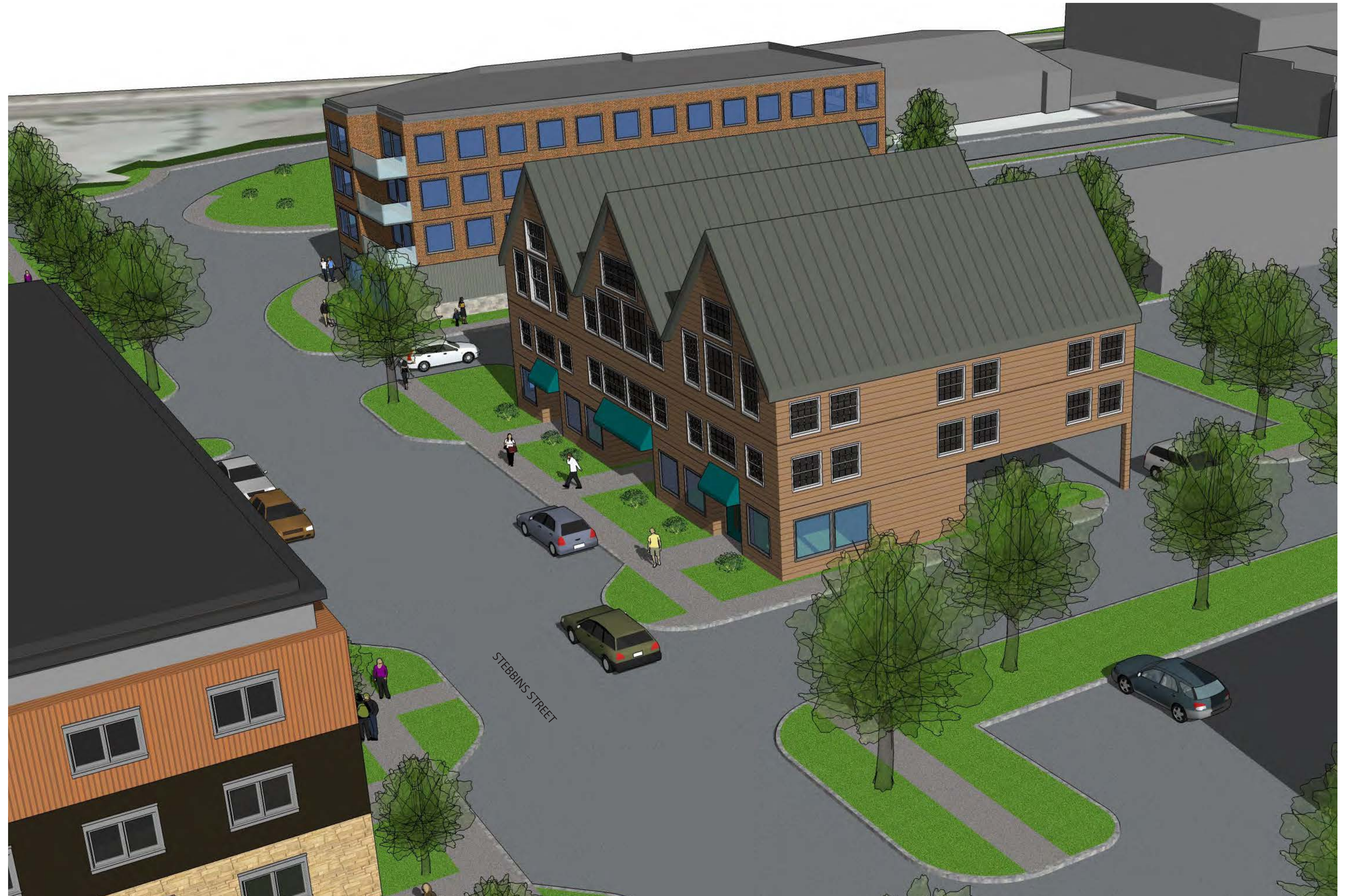
Birds-Eye Building B