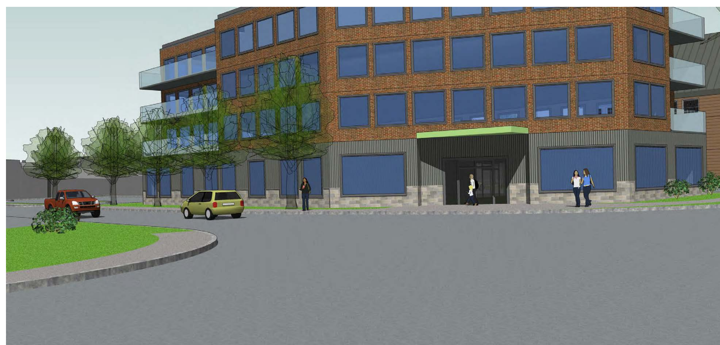
Street View Building A