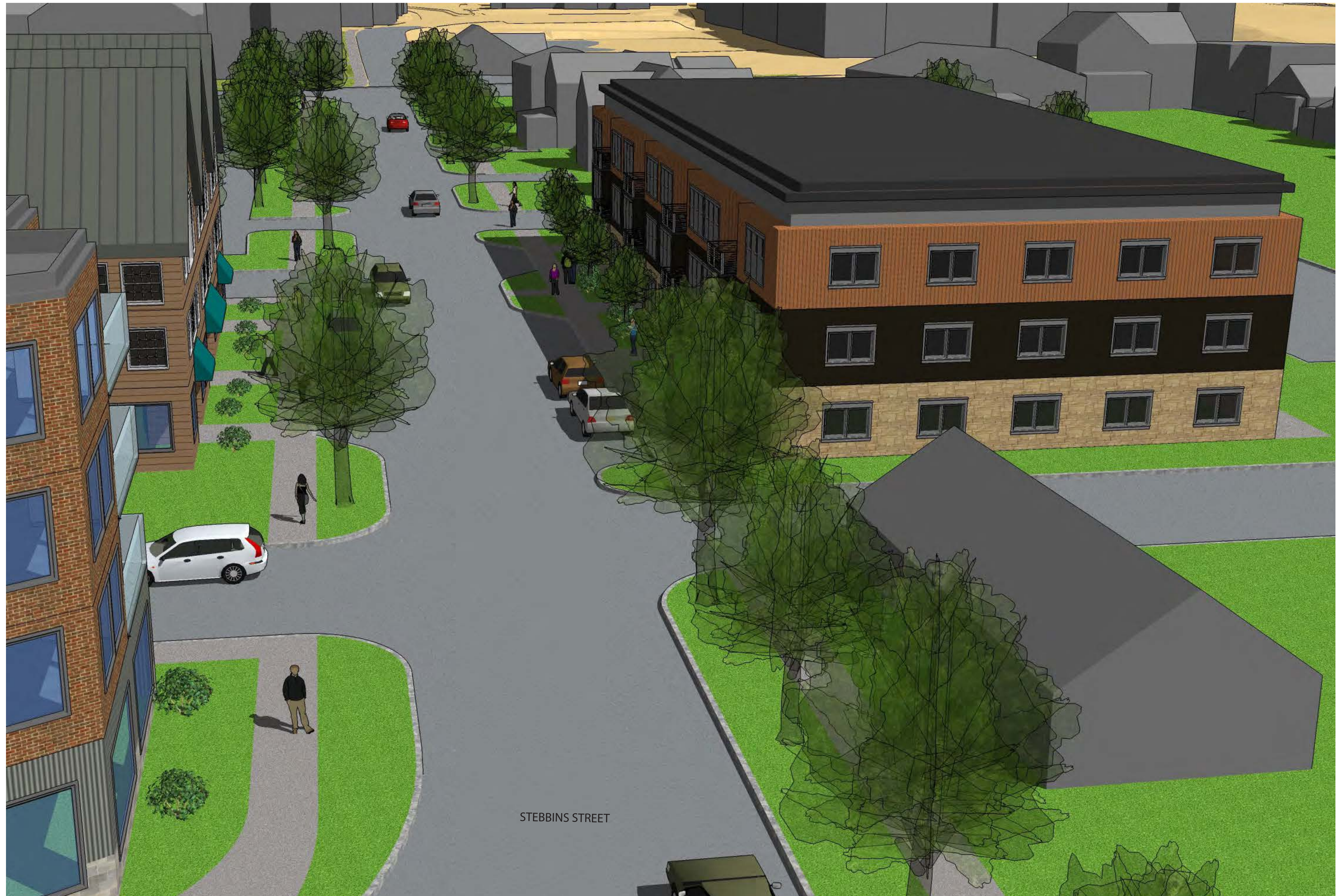
Birds-Eye Building C