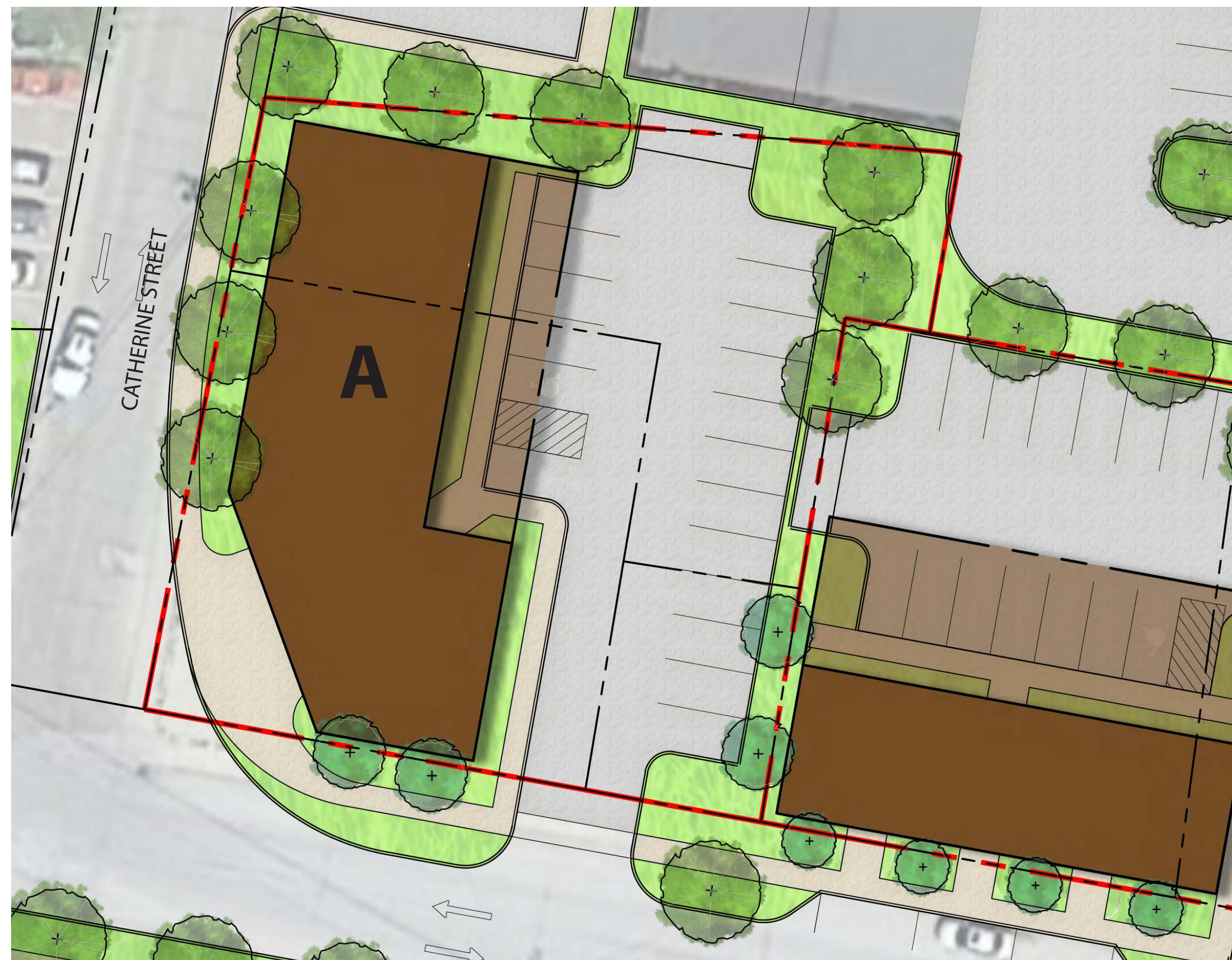
Redevelopment Site A