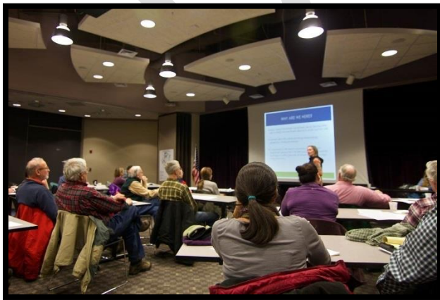
Figure 1 - Act 174 Meeting in Hyde Park, VT

energy plan. Once a municipal board has been designated, determine how other municipal boards and the community in general will be kept informed during plan development.